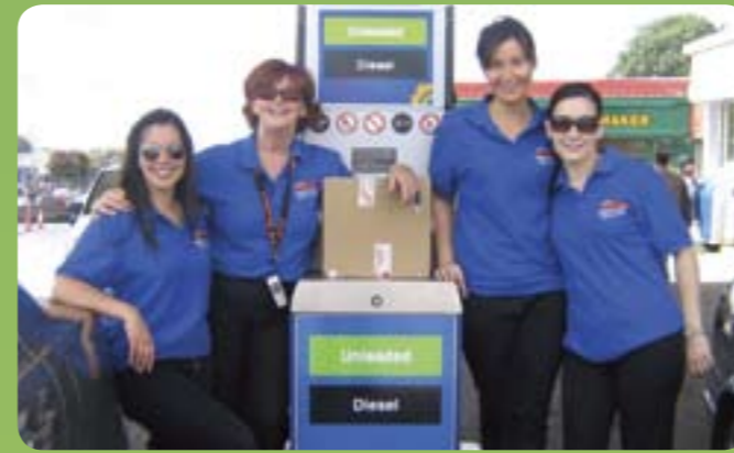
Members of Limerick Live 95FM promotional crew during the regional rollout

In the evening we recognised many of our site teams and managers in our retail awards. There were nine categories of awards that night and the nominees and winners are all to be congratulated. I would like to especially mention the team at Manor, Waterford who won the best gap score award with a fantastic score of