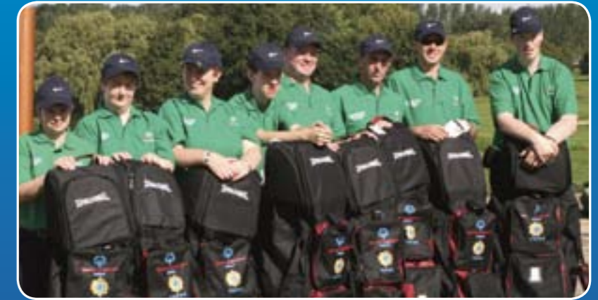
Members of the 2008 Topaz Triple Crown Team

The competition was played in a wonderful atmosphere of sportsmanship and friendliness. These teams of golfers are definitely the most